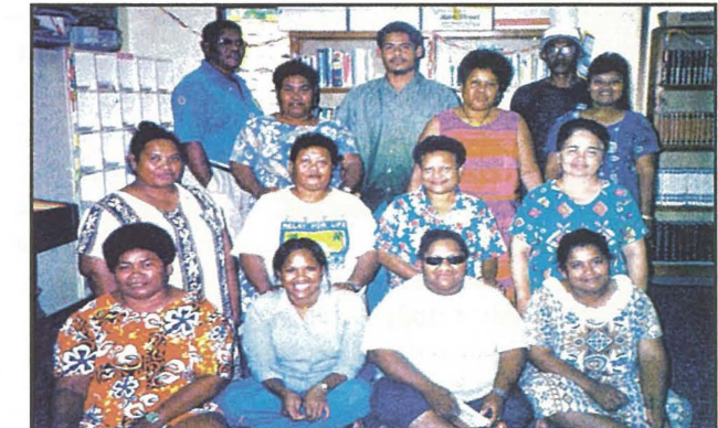
Government Employees based in Aimeliik Elementary School, Aimeliik State Government and State Legislature who are generous donors to the PCC Endowment Fund