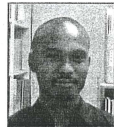
Duke Joseph Honor List