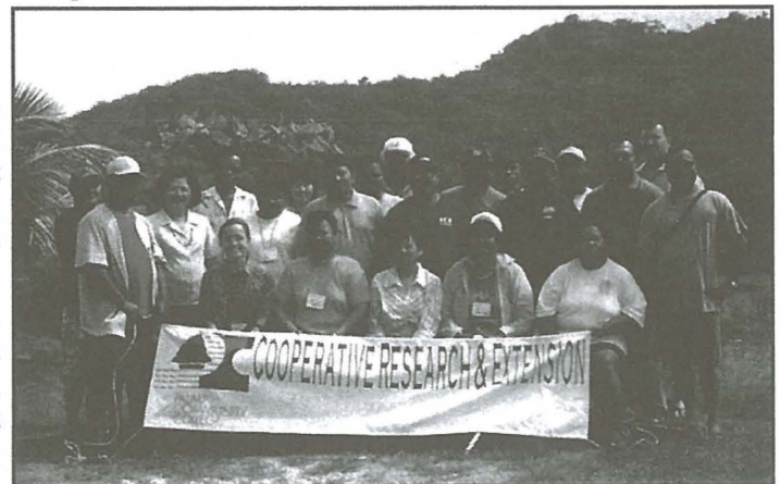
Participants in the Soil Training Workshop pose for group pic