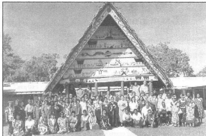
Pacific Islands Association of Libraries and Archives (PIALA) '99 participants gather in front of the PCC Bai for a group photo. Participants came from as far as California and Hawaii. Countries, states and territories represented: California, Hawaii, Republic of the Marshall Islands, Chuuk, Kosrae, Pohnpei, Yap, Guam, CNMI, Philippines, American Samoa, Papua New Guinea, and Republic of Palau.