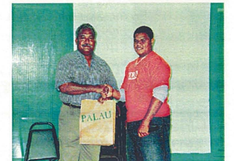
Upward Bound Student (r) presenting gift to PCC President (l)