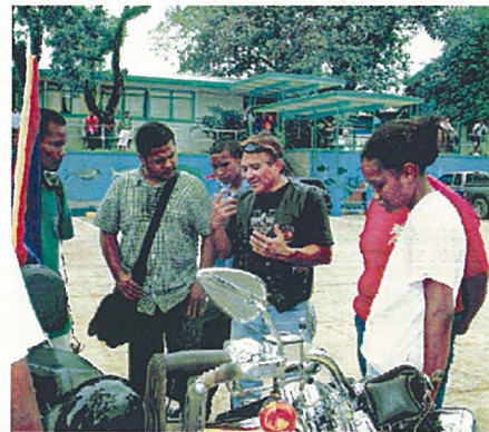
Guam Harley- Davidson Bike Owner giving some one-on-one lessons to PCC Students

The Guam Harley-Davidson bike riders arrived on campus near Track and Field on Thursday to showcase their prized bikes. This whole event was organized between Shimbros and PCC to display Harley-Davidson bikes to PCC Auto Mechanic students. PCC students took this perhaps once in a lifetime one-on-one opportunity to ask questions regarding the bikes' features, maintenance, etc. As part of the event, the students took rounds riding with the bike owners to Ngarachamoyong and back. It was a fun and educational approach to learning for the students.