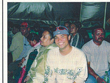
PCC Students under their tent