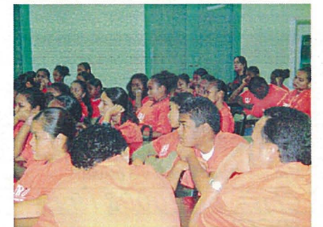
Upward Bound Classic Students listen attentively