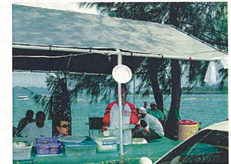
PCC Pohnpei Booth at Japan Friendship Bridge