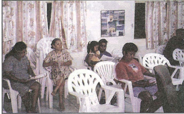
Residents from Ngchesar State listening to a presentation on training programs offered by the CE Office.