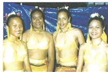
Palauan Dancers ready to perform traditional dance.