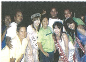
PCC students and Staff pose with Some Beauties from Japan