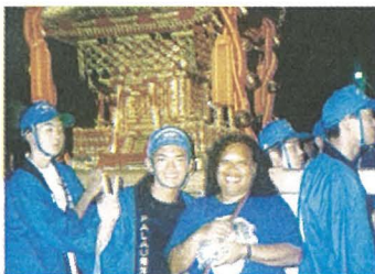
The Japanese "Omigosh" float has become a regular entrant in the annual Independence Day Parade. Page 2