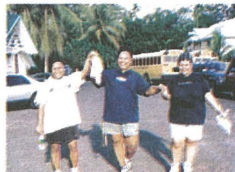
These Wakathon participants celebrate as they cross the finish line. Great Job Girls!