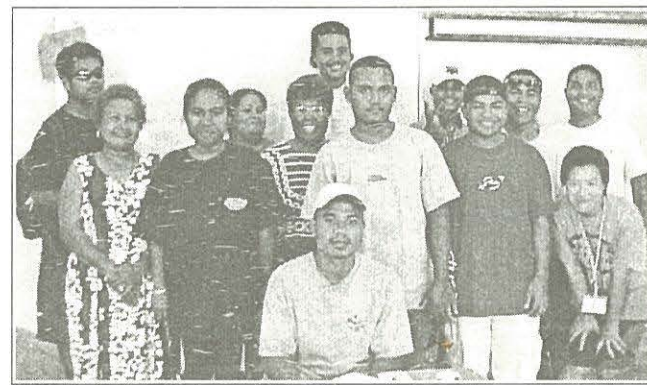
PCC Agricultural Science Club Officers and members. The club is one of the most "active" clubs on campus.