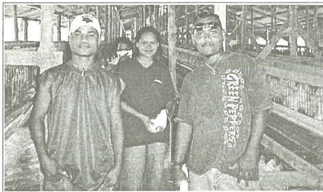
PCC Agricultural Science students touring the PMA Poultry Farm.

We would like to thank the Lakobong Piggery and the PMA Poultry Farm for the educational tour and their helpful hospitality.