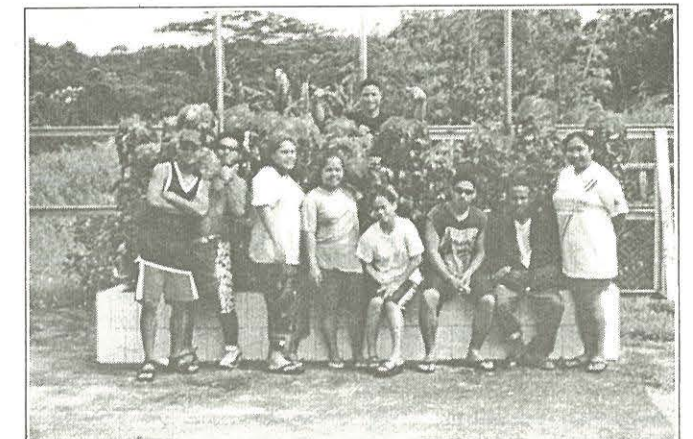
On their way back from the falls, the CSO break for a picture.