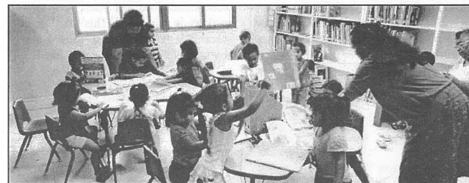
Day Care children enjoying Kid's Korner.

Children from the Belau Day Care Center paid a short visit to the Tan Siu Lin PCC Library on October 5, 2012. They were given the opportunity to see the different books of-