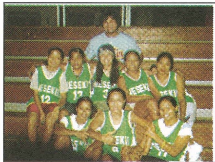
Palau Community College Mesekiu Women's Volleyball Team