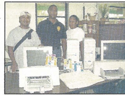
Police Academy Staff

PCC donated computers, printers, and inks to the Police Academy earlier this month. This is the second time that PCC has donated computers to the Ministry of Justice. PCC previously donated to Fish & Wildlife Protection.