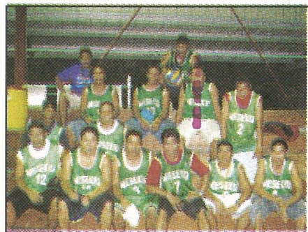
Palau Community College Mesekiu Men's Volleyball Team