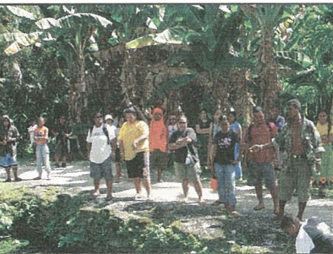
PCC students on a scenic tour of Kayangel's historical sites.