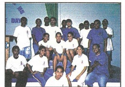
These UB participants are all smiles.

An orientation program for all current and newly selected Upward Bound Program participants was held on October 8, 2005 at the PCC Cafeteria. Participants were given folders containing student handbooks, class and tutoring schedules and milestones of activities for the whole school year, and other accessories for students to use during the monthly workshops and other functions of the program. At the conclusion of the orientation, students went on a tour of the PCC campus while wearing their Upward Bound t-shirts.