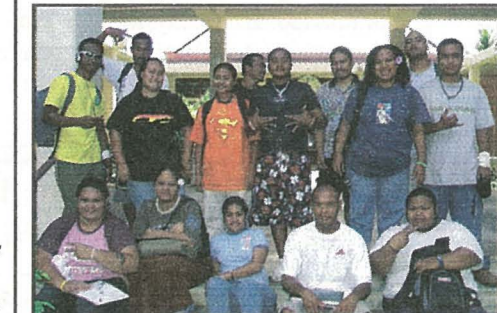
Project Beacon students pose in front of the Koror State Capitol building after their Jobsite visit.