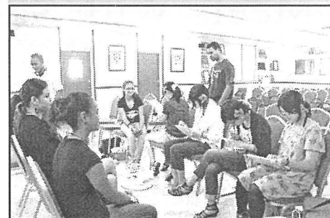
PCC students interacting with Niigata students.