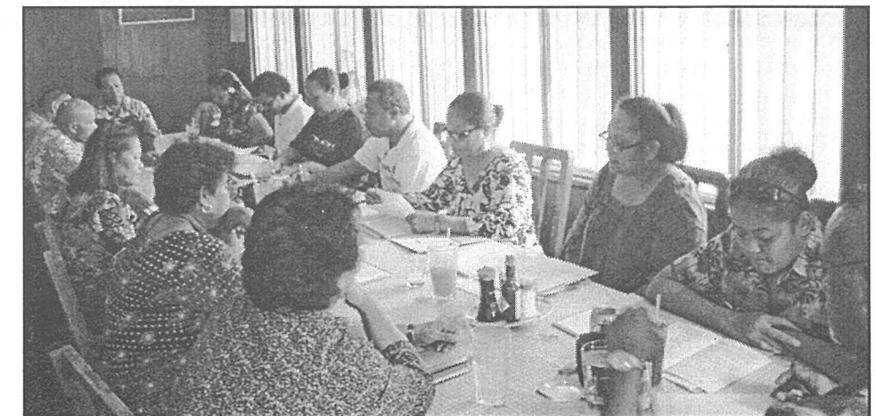
ETS meeting with target schools' principals.

ETS Director and staff would like to thank all school principals and representatives who attended the meeting.