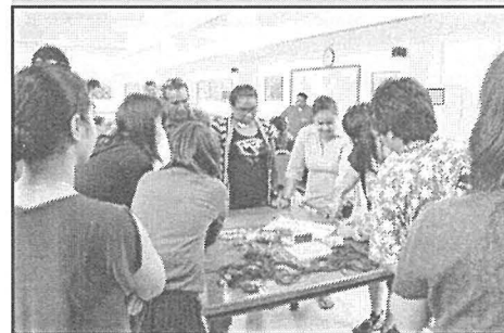
Niigata students demonstrating to PCC students.

and sharing their talents/skills in fine arts with PCC students. The visit was an opportunity for students from both institutions to interact and to establish potential long term collaborative relationship between the two institutions.