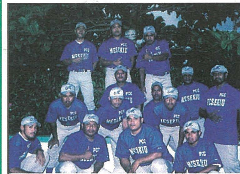
PCC's 2004-05 Mesekiu Baseball Team

Once again, the Palau Major League season is getting ready for another exciting season. The College is recruiting players for this year's Mesekiu Baseball Team. If you are interested in joining our team, please sign up at the Recreation Office. This year we have some very promising new players who were members of the Palau National Team during the recent South Pacific Mini-Games. Join them and represent your College. Athletic Scholarships are available to qualified students. The first team meeting will take place on Monday, October 24, 2005 at 11:30 am. at the Mesekiu Bai, during which the practice schedule will be established.