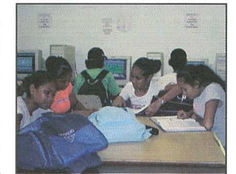
Project Beacon students busy studying.

purpose of the activity is to provide a place where students can walk in during their free time and review for the mid-terms. Snacks and refreshments were made available to sustain the students as they studied. Program Instructors, Counselors, as well as peer tutors/counselors were available for assistance with reviews, and organization of notes. A total of one-hundred forty-six (146)