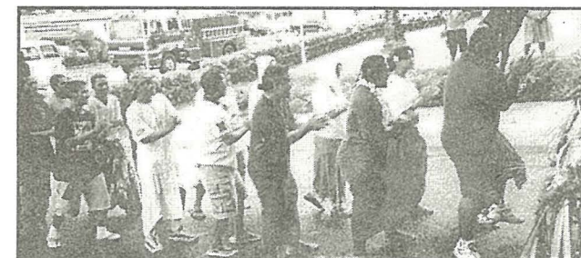
FSM was represented by PCC students who wowed the crowd with their dance prowess