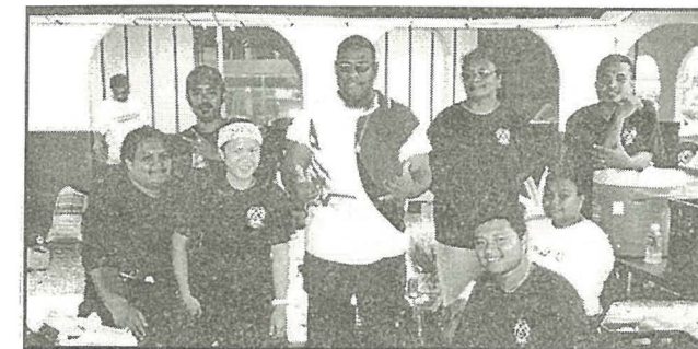
Taking a break from selling their agriculture products, PCC students in the Agriculture Club pose for a group photo