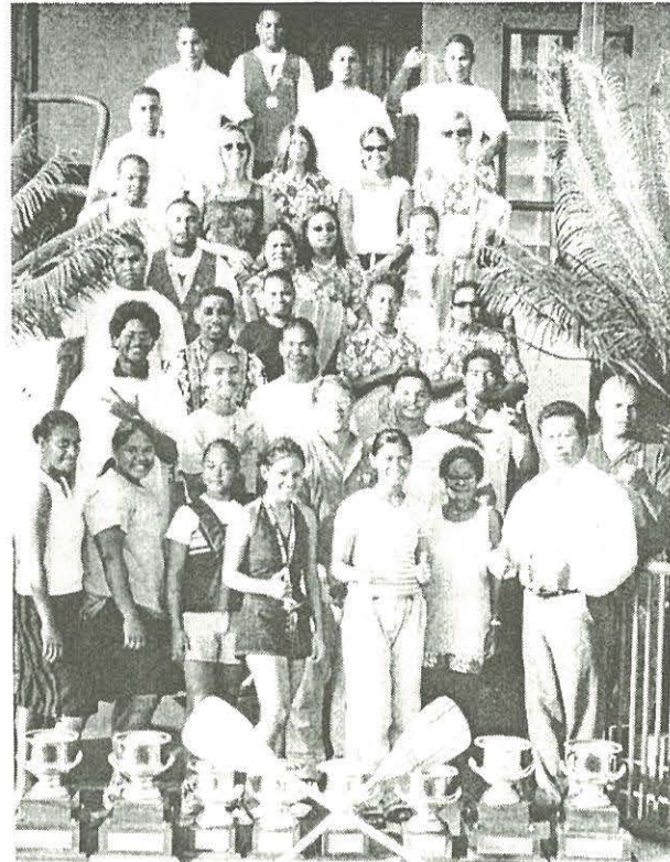
Senator Steven Kanai, PCC alumnus celebrates the numerous trophies and team medals won by the Palau paddlers during Micronesia Cup 2001. PCC students (top row) paddled for Ngaraard Red Torch and won two silver medals in the sprints and a gold in the marathon.