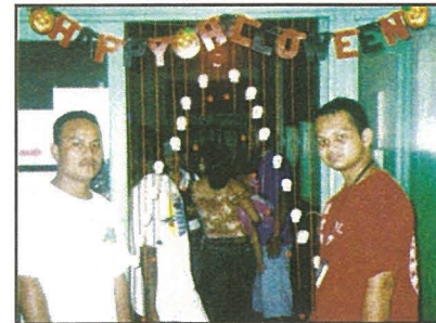
PCC Student Acting As Bouncers Making Sure Everything runs Safely and Smoothly