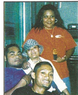
PCC Students Chilling Out

The PCC Student Body Hosted a Halloween Party this Sunday as a way to bring students together for some ghostly fun. Over sixty children and PCC students participated in the scary event which was held at the PCC Cafeteria. There was live entertainment, music, and dancing with refreshments and snacks provided by the PCC Cafeteria. The Halloween party lasted from 7:00 pm to 11:00 pm. and everyone who attended had spooky, cooky and fun experience.