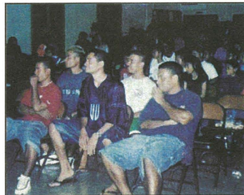
PCC Students Being Entertained by the Band