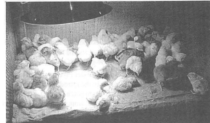
Chicks for Sonsorol Elementary School

Be sure to read future issues of Mesekiu's News for progress reports on this project.