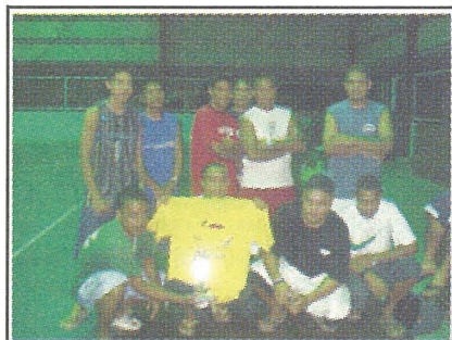
Palau Volleyball Federation (PVF) Open Men's League 3rd place winner- PCC Mesekiu Team

In three months, the volleyball open and co-ed league finally ended earlier this month. PCC joined by forming two teams in the open league, the PCC Mesekiu Men's team and the PCC Mesekiu Women's team. Both teams made it to the playoffs and as a result,