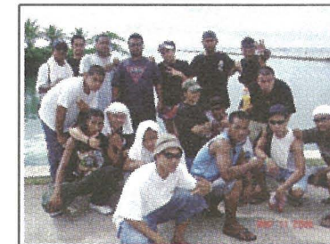
PCC Pohnpei State Organization Members

Eighteen Pohnpei State Organization (PSO) members headed out to Babeldaob this past weekend to tour. Their first stop was Ngerulmud, the new capitol building in Melekeok. There the students were amazed as they were briefed on the history of the capitol movement as written in the constitution, the permanent