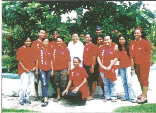
Vice President Sandra S. Pierantozzi posing with PCC Environmental Club Students.