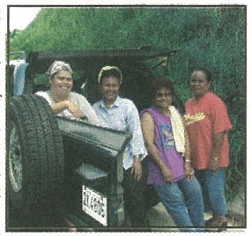
These PCC staff members take a break after uprooting Kebeas vines.