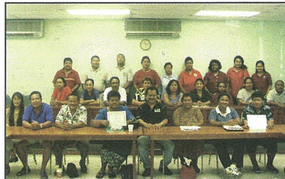
Participants of the Accounting Workshop conducted by the Public Auditors pose for the Mesekiu News.