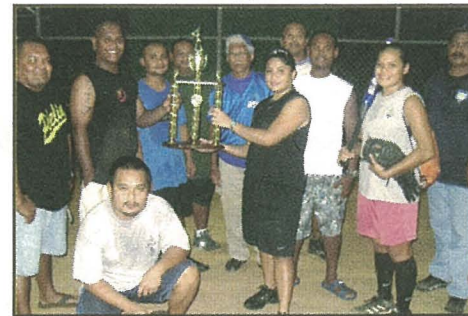
Tournament winners: PNOC display their championship trophy and pose with officials from BSUA and Tiull 2000.