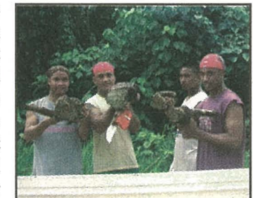
PCC students display stumps of the Kebeas vine they have just cut!

In honor of the Thanksgiving Holiday, PCC staff, students and faculty conducted a Mikania Kebeas eradication project held at Ngchesechang, Airai State. Almost a hundred PCC students and staff participated in the event and worked together to clear almost a mile of the dreaded Kebeas. The Kebeas is an invasive species which, if left unmonitored, could pose a danger to Palau's delicate eco-system because it can rapidly outgrow and overwhelm Palau's forests. This invasive plant is a fast growing vine that blankets Palau's forests and suffocates them by blocking out the sun. It is an aggressive plant that grows throughout the Palauan island chain and poses a danger to Palau's delicate eco-system because it can wipe out forests that serve as a natural habitat for many of Palau's unique bird and animal species that depend on the forests for food and shelter. After a hard day's work in the hot sun and rummaging through the jungle, participants were treated to cool refreshments and a wonderful Thanksgiving luncheon with all the fixings prepared by PCC's cafeteria staff. The Kebeas eradication project is part of the College's effort to help protect Palau's rich environment while giving back to the community. PCC President Dr. Patrick U. Tellei said, "The Kebeas eradication project served as an opportunity to work side by side with our staff and students to protect our natural environment, reaffirm our bonds as one PCC family and share in the spirit of Thanksgiving."