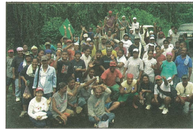
PCC staff and students are all smiles after a hard day's work of clearing the Kebeas.