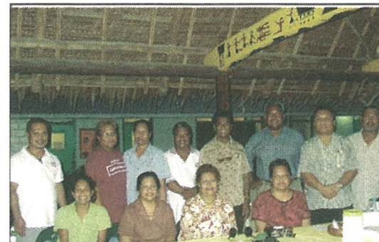
Members of the PCC family pose with the Honorable Senator Surangel Whipps and Honorable Senator Alfonso Diaz during the 7th Annual Thanksgiving Endowment Fundraiser.

A very grateful Palau Community College family of Trustees, administration, faculty and staff, and most especially students, would like to thank the many agencies, businesses, corporations, groups, and individuals for their generous support. Your commitment to Palau's only institution of higher education has resulted in a most successful 7 th Thanksgiving Fundraiser for the PCC Endowment Fund, where we exceeded our $20,000 goal, and in fact raised over $36,000! We would also like to express our appreciation to Senator Alfonso Diaz, a long time trusted friend and supporter of the College for broadcasting the fundraiser live on his radio station, 89.5 for the fourth straight year in a row. In the spirit of this season of Thanksgiving, we would like to acknowledge all of you for your support and commitment to the fundraiser by providing prizes, making donations and purchasing tickets. Your support has truly made a difference and we here at PCC are truly grateful to everyone who supported our fundraiser for your kindness and generosity. Thank you very much!