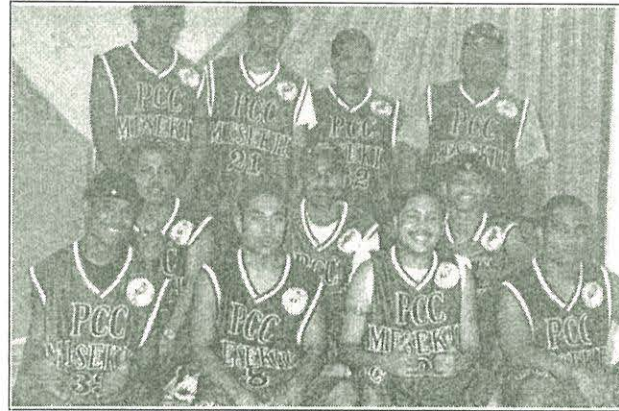
PCC Mesekiu Basketball Team