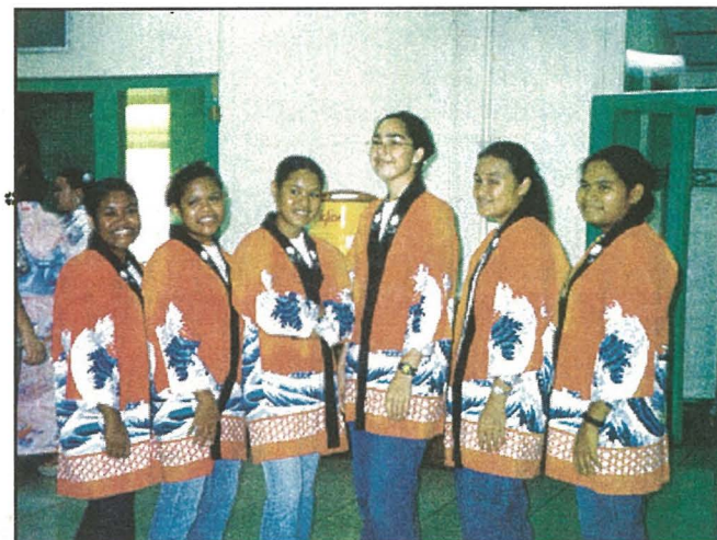
Mindzenty High School Pose In Traditional Japanese Attire During Japanese Language Fair