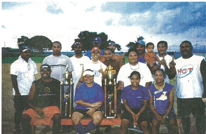
This year's Co-ed champion is Team MOKKO. The photo above shows them proudly displaying their trophy with tournament officials.