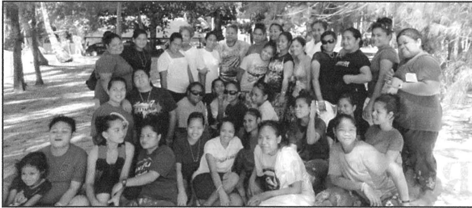
Advisors and dorm female residents.