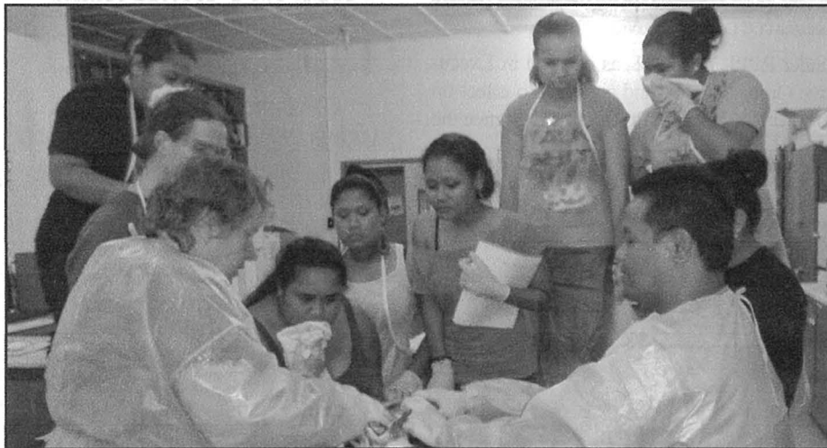
A&P students observing a dissection performed by the veterinarians.