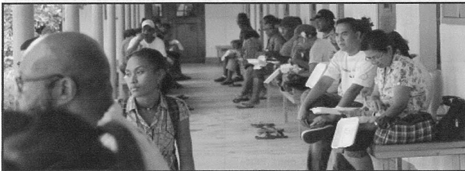
College faculty & staff.

The college commemorated this year's Thanksgiving with a Special Day of Ap-