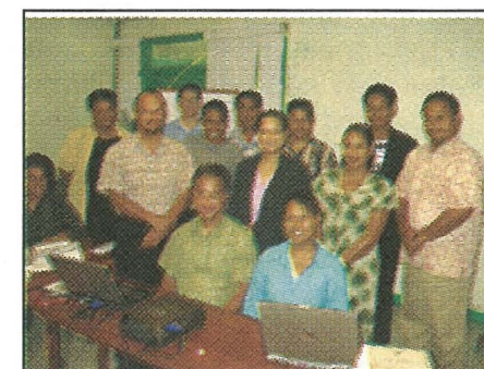
National Development Bank of Palau Employees at CE Training Room

Palau Community College has been availing its Continuing Education (CE) training room, for the past two weeks, to the participants of the Core Credit Training organized by the National Development Bank of Palau (NDBP) through the Association of Development Financing Institutions in Asia and the Pacific (ADFIAP). The participants of this training came from Fiji, Saipan, Federated States of Micronesia, Bank of Hawaii, and NDBP.