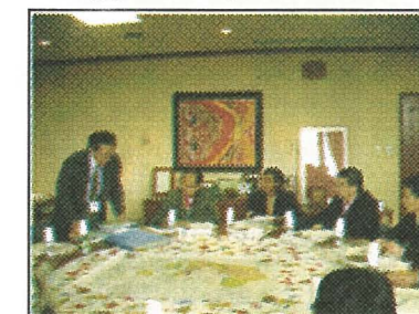
(l-r) Nara Prefecture's Board of Education Member with the Participants