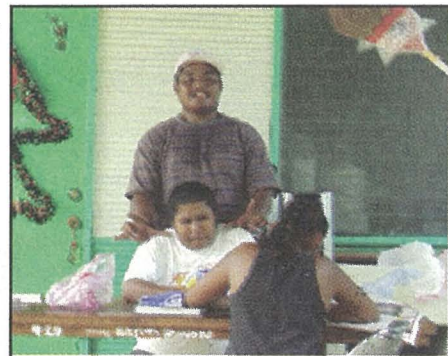
AHS students busy studying for their final tests.