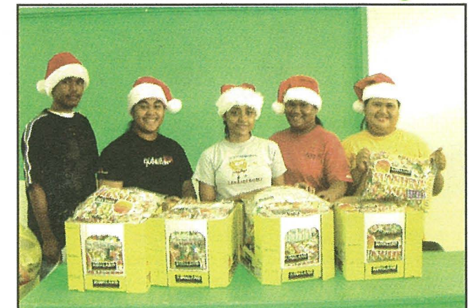
These elves from the PCC Tourism Club have generously donated their time to pack the candy bags that will be given out to the children on Friday, December 16, 2005.

As it has become a tradition at the College, PCC will once again be sponsoring Santa Claus at the annual Christmas Caroling program coordinated by the national government. The Olbiil Era Kelulau grounds across from the College, locally referred to as 'Bethlehem', will once again be the site for this annual program. The nightly performances by Palau's students representing local schools and community groups/organizations will run from December 12 th -23 rd , according to the Ministry of Community and Cultural Affairs. PCC will be sponsoring Santa Clause and his elves on Friday, December 16 th . As such, children of all ages are reminded to mark their calendars as you are all invited to come listen to songs of the season and receive gifts from Santa, courtesy of PCC!