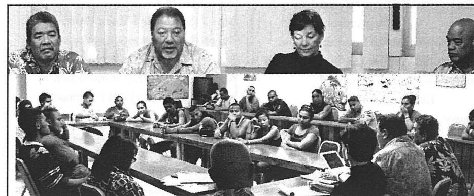
FSM Congress Officials meeting with FSM students.

Contributed by Admissions & Financial Aid