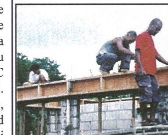
PCC Students Busy Building Bungalow

PCC students from the Construction Technology Program gain valuable experience while building a bungalow for the College. The bungalow is located behind the Temekai Building and the Wind Orchestra Building on PCC's lower campus.