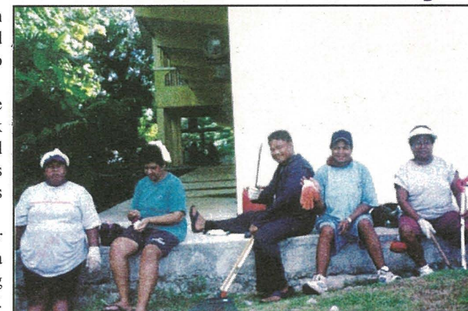
PCC Staff Taking a Breather from trimming, cutting grass and landscaping PCC Campus, great job guys and girls!

The College thanks the PCC staff for taking time from their busy schedule to clean the campus and would like to express a special thank you to all the members of the PCC-CRE for donating their time to making PCC a beautiful campus we all can be proud of. PCC is more than a college campus it is our home, thank you all for your hard work and dedication.