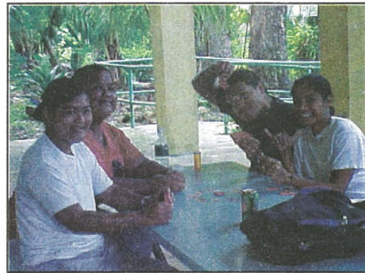
PCC Students making good use of their time enjoying a game of Hanakuda while waiting for their classes.