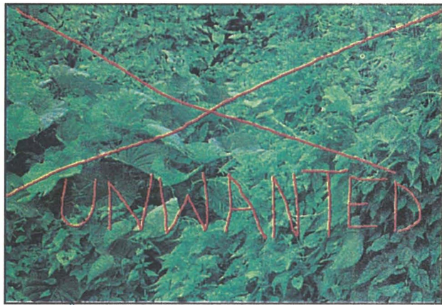
( Mikania micrantha , Teb el Yas , or "Mile-a-Minute")

Everyone is invited to join in the 5 th Annual Mikania Clean Up sponsored by the Bureau of Agriculture, Office of Environmental Response and Coordination (OERC), the Palau Conservation Society (PCS), and the Peleliu State Government. This year's Mikania Clean Up will be held at Peleliu State this February 12, 2004. The goal of the event is to rid the State of Peleliu of the terrible ( Mikania micrantha , Teb el Yas , or "Mile-a-Minute") which has spread throughout the surrounding forest area. Peleliu State has a large infestation of the Mikania.