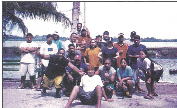
Students pose proudly after successfully collecting trash from Ice Box Park all the way to the PCC campus!