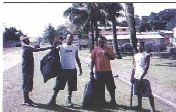
These students forget about collecting trash momentarily as they pose for a photo!