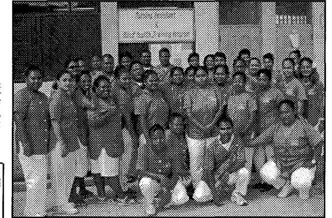
Participants of the Health foundation course/training pose in front of their classroom at PCC.