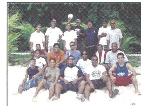
Builder's Club Members at Ngeremdiu

will be accepting small community projects with a construction component at minimal cost. Proceeds from the projects will go towards new tools and equipment for the club, and the PCC Endowment Fund.