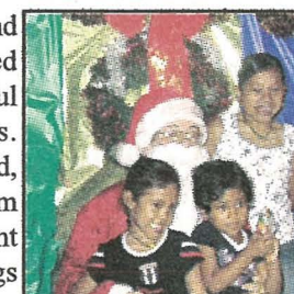
These kids are all smiles.

Last Friday, PCC students and staff became Santa's elves as he graced the 'Bethlehem Park' after a wonderful performance by the King's Kids. Having anticipated a good-sized crowd, the College, with the help of the Tourism Club and Adult High School Student Body Organization prepared 1000 bags of candies and pencils to be given by Santa Claus. Santa was quite a big hit