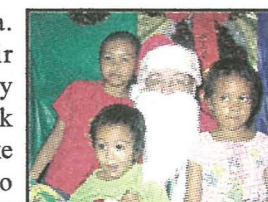
These kids got their Christmas wish list to Santa.

volunteering as PCC's jolly Santa Claus. The College would like to wish everyone a "HO HO HO, MERRY CHRISTMAS AND A HAPPY NEW YEAR!"