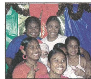
Even the older kids want to be with Santa.

Last Friday, PCC students and staff became Santa's elves as he graced the 'Bethlehem Park' after a wonderful performance by the King's Kids. Having anticipated a good-sized crowd, the College, with the help of the Tourism Club and Adult High School Student Body Organization prepared 1000 bags of candies and pencils to be given by Santa Claus. Santa was quite a big hit