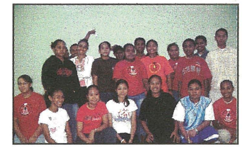
This group of UB students are all smiles after their tests.