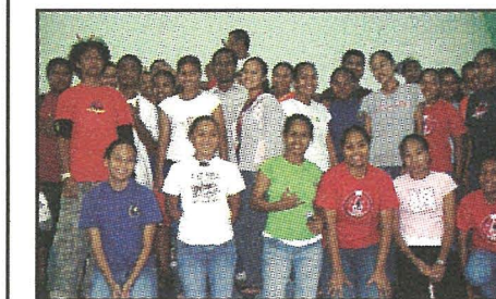
Happy UB students pose after finishing their exams.