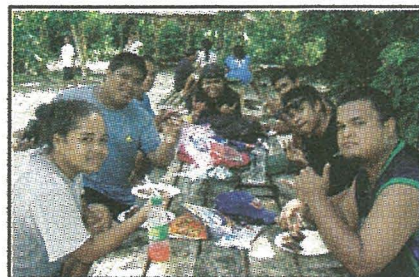
PCC students having a lunch break.