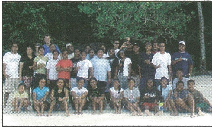
ETS staff, and tutors pose with their students on the beach at Ulong Rock Island.

On December 10, 2005, Talent Search staff took their clients from Mindszenty High School and their tutors on a cultural field trip to Ulong for a well deserved rest and fun day. Thirty-one students signed up and went, along with their two tutors. The kids spent the entire day playing in the water, digging themselves into the sand and being serenaded by anyone who could play the guitar that was brought along. Before long, everyone got back into the boats and went to visit the "CEMETERY". Feeding the fish brought amazement onto the students' faces as a Napoleon Wrasse (Kemedukl) showed up to feed among the smaller fishes. It felt as if the boat would just tip over, as everyone tried to get a glimpse of this wondrous sight. A few brave souls jumped into the water to swim with the fishes. After leaving the Cemetery, they headed on to "SOFT CORAL" where they also swam with the few fishes and looked at the beautiful corals. They then proceeded to the shipwreck site and swam some more. After that they headed back to Koror, even though the students weren't ready to come back home. They came back, sun burned and tired, but refreshed and carefree, ready to meet the new week of studying and exams.