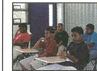
UB Students preparing for tests.

Upward Bound Program is utilizing different ACT Assessment Components as its Assessment tools for this project year 2005-2006. For example, the Upward Bound 11th & 12th Graders are using ACT Assessment Test while 10th Grade are using ACT PLAN, while 9th Grade are using ACT EXPLORE. ACT Assessment is structured to assess high school students (11th & 12th Graders) general educational development and their ability to complete college-level work. ACT PLAN on the other hand, helps