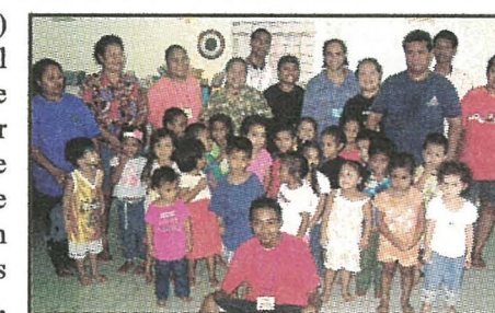
Children and staff from PCC Daycare pose with SBA and advisors.

PCC's Student Body Association (SBA) conducted toys for tots program for the Belau National Hospital (BNH) Children's Ward and the PCC Daycare Center. The SBA donated $500 worth of new toys to over thirty children at the PCC Daycare, young patients in the children's ward and the BNH Children's playroom. The toys was personally delivered directly to the children who were extremely happy to get their Christmas presents early this year. The toys consisted of stuffed animals, games, puzzles, coloring books, building blocks and other educational toys. SBA members were welcomed by the