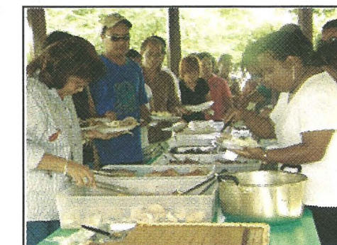
More Staff lined up to get their food