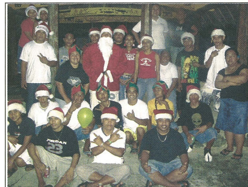
Palau Community College students pose in front of PCC Mesekiu Bai after distributing candy at this year's Christmas program at Bethlehem Park.