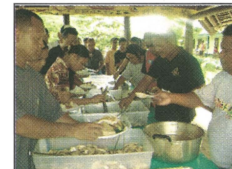
PCC Staff and students digging in on the delicious food