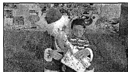
Santa Claus & Day Care son.