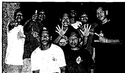
Maintenance staff and guest.

The Physical Plant Division, which is actually the hands and feet of the college, celebrated the Christmas holiday on Thursday, Dec. 23, 2010.