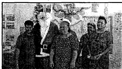
Santa Claus with Day Care staff.