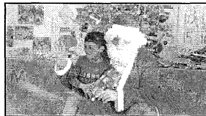
Santa Claus & Day Care daughter.