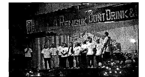
PCC Music Club.

The PCC Music Club in collaboration with the Ministry of Health hosted a DeWill a Renguk Christmas Gala 2010 at Ngarachemayong Cultural Center on Dec. 22, 2010. It was a spectacular evening with a large crowd. Not a single seat was empty and the entrance was blocked with people standing around. The participating elementary schools included Seventh Day Adventist, G.B. Harris Elementary, Koror Elementary, Meyuns Elementary, and Maris Stella School.