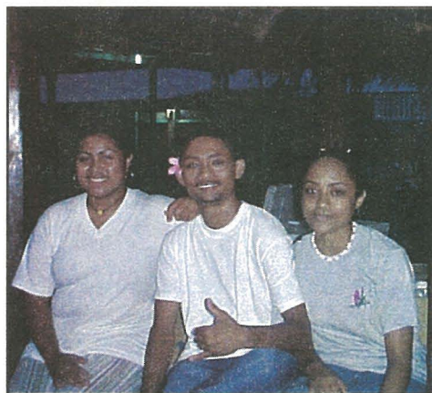
PCC Students are all smiles as they are all full and satisfied after enjoying a great meal.