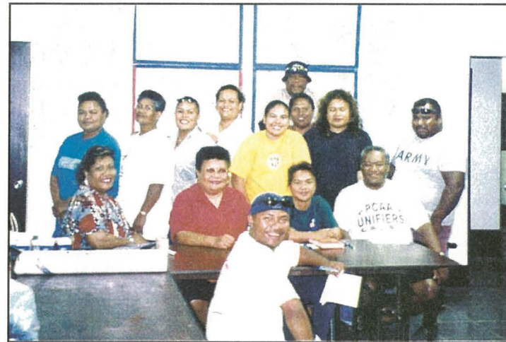
Head Start staff pose for a group photo after having enrolled to become the newest members of the PCC Endowment Fund Contributors' Club. PCC is very excited that they have joined the program!