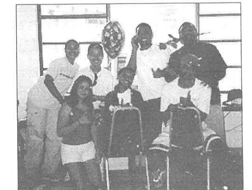
PCC Students take time out from their rigorous class schedules to enjoy Valentines Day.