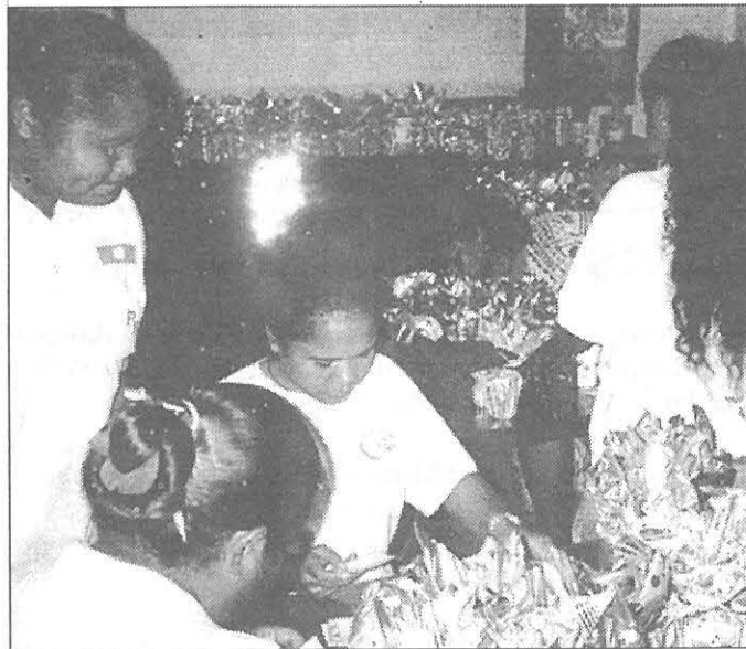
Upward Bound Program students and staff turned the UB office into a "candy gram mill" churning out 10 candy grams a minute on Valentines day.