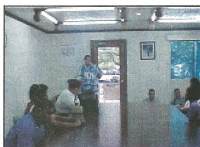
PDC Boardroom presentation