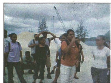
PDC Rock Quarry