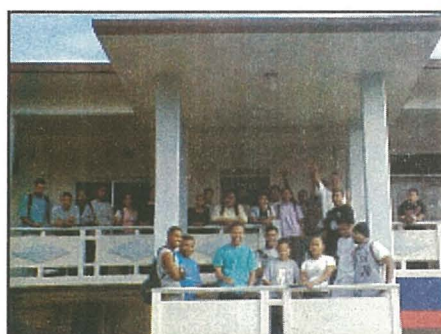
PDC Corporate Office

Pictures of the Project Beacon students during their visit to the PDC main office and all of its subsidiary companies.