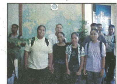
PDC Travel Office Tour