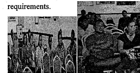
Parents and UB students (9th - 11th graders) attending workshop

Workshop for underclassmen (9th - 11th grades) and their parents was held on February 9, 2011. Topics discussed at the workshop varied from financial planning, budgeting and financial literacy; academic year 2010-2011 overview and updates on student's progress reports and program requirements.