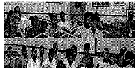
Parents and UB Seniors attending the workshop