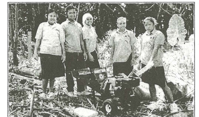
PHS agriculture students ready the shredder to make compost.