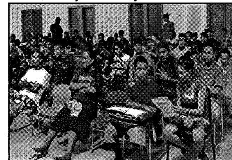
Dorm students waiting for movie to start.

On Tuesday night, March 01, the cafeteria was packed with dorm residents who were there to attend the monthly Tuesday Night event. They anxiously waited for dorm