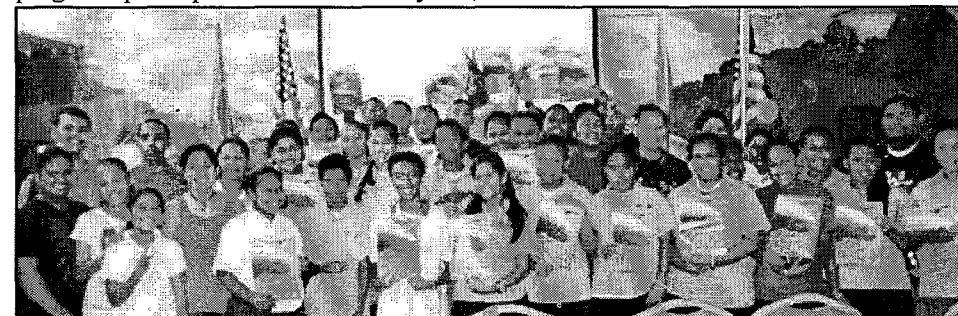
UBMS students and the EMS club members.

Palau Community College is an accessible public educational institution helping to meet the technical, academic, cultural, social, and economic needs of students and communities by promoting learning opportunities and developing personal excellence.