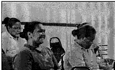
Tutors and parents discussing ideas.