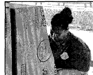
Students casting their votes.

Special Election on Monday, February 28, at the courtyard. The Special election was to elect the following vacancies: ASPCC Office of the President - Elect (Vice-President), Sophomore Representative, Freshman