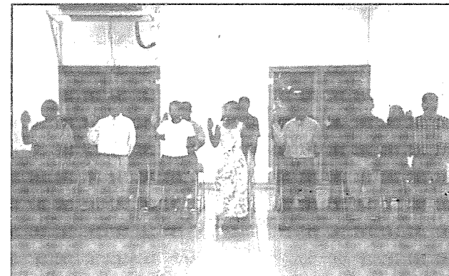
PCC SBA Officers & Senate members

The new SBA office is located in the former Amissions & Financial Aid office. Everyone is welcome.