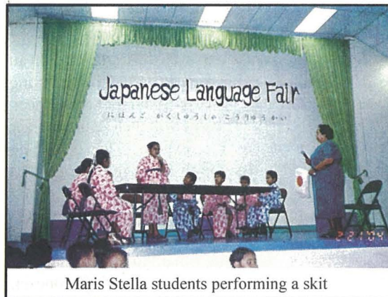
Maris Stella students performing a skit

If you are interested in Japanese language courses offered at PCC, contact Admissions office at telephone number 488-2471, extension 234.