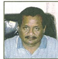
Gov. Lazarus Kodep