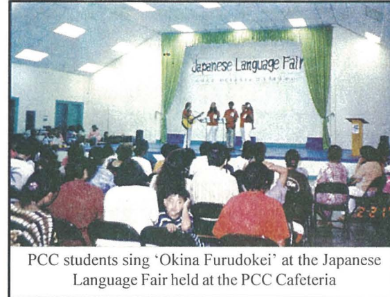
PCC students sing 'Okina Furudokei' at the Japanese Language Fair held at the PCC Cafeteria