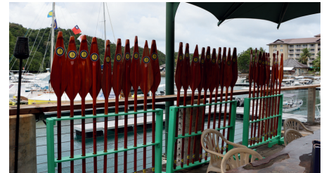
HANDCRAFTED OARS MADE FOR THE CREW