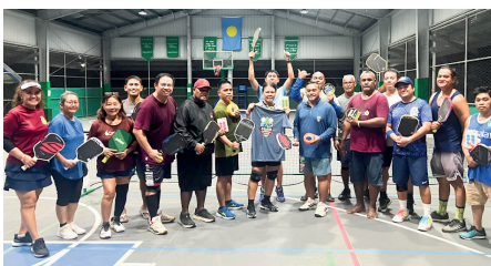
PALAU PICKLEBALL AND PGA MEMBERS