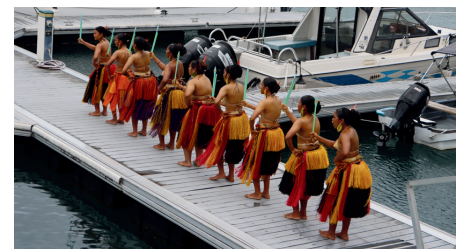
PALAUAN AIRAI DANCERS