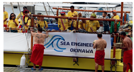
THE BLESSING OF THE CREW AND CANOE