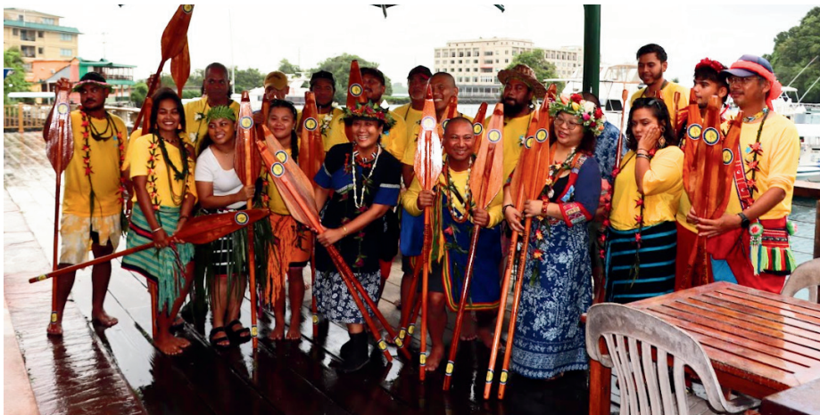
THE CREW OF THE ALINGANO MAISU PICTURED WITH THEIR GIFTED OARS

On May 29th, 2026, Palau Community College (PCC) hosted the official welcoming ceremony for the historic Alingano Maisu voyaging canoe and its crew members. While the traditional vessel and its courageous sailors originally arrived in Palauan waters on May 11th, this designated event served as the official, formal reception to honor their voyage and cultural significance to the region.